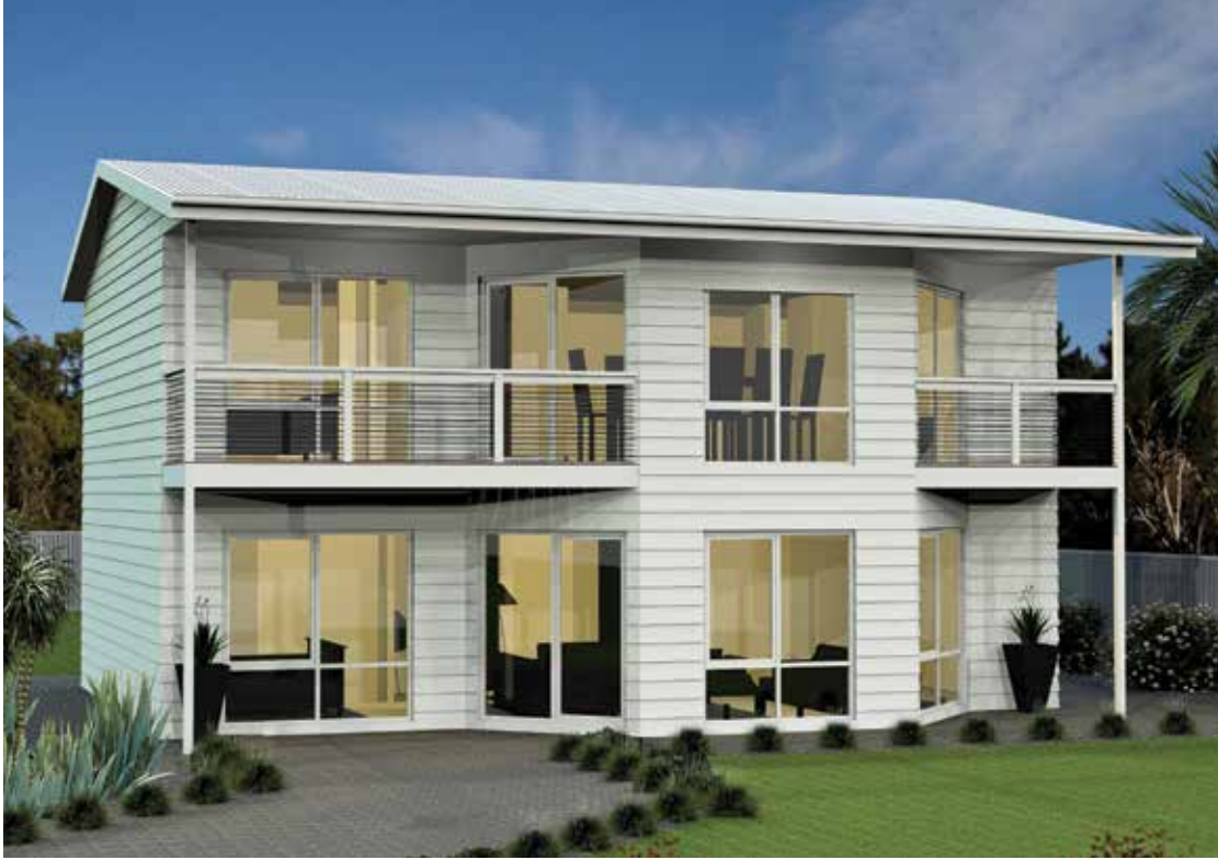
PATTERSON 2 STOREY 175