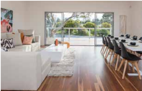
MCCUBBIN 2 STOREY FRONT CARPORT (3 BED)