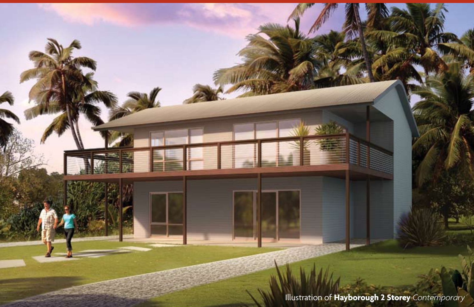
Illustration of Hayborough 2 Storey Contemporary