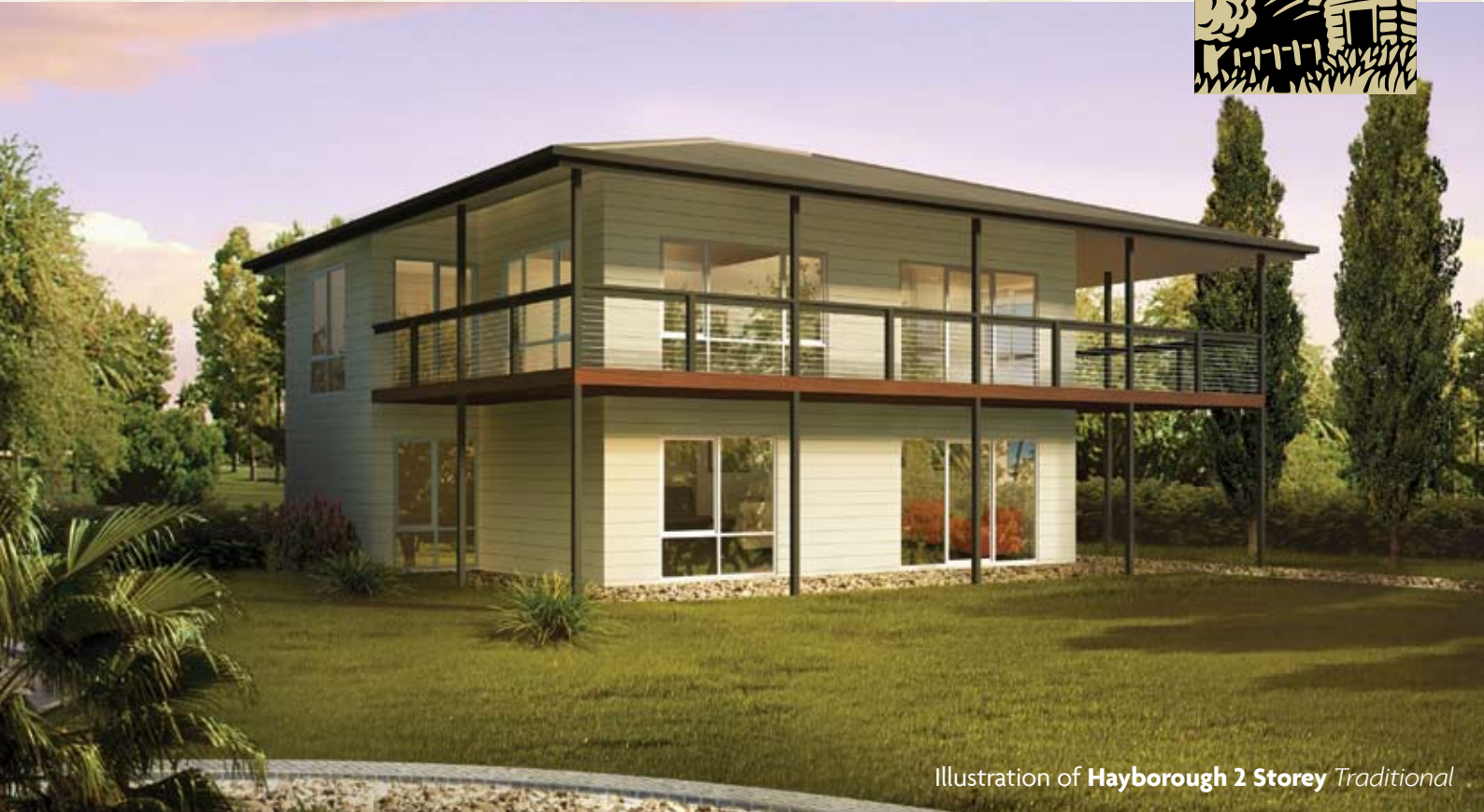
Illustration of Hayborough 2 Storey Traditional